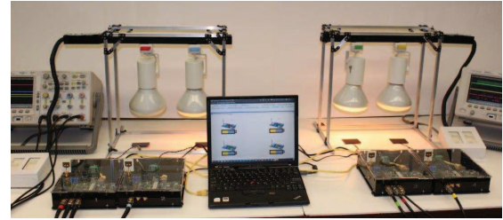
Figure 3. EnHANT demonstration setup.

The demonstration setup, shown in Fig. 3, consists of four prototypes communicating with each other wirelessly using UWB-IR transceivers. An oscilloscope connected to a prototype is used to show impulse-radio-based wireless communications . Using an oscilloscope, demo participants can observe the individual pulses generated by the prototypes, and can visualize the details of the employed modulation and en-